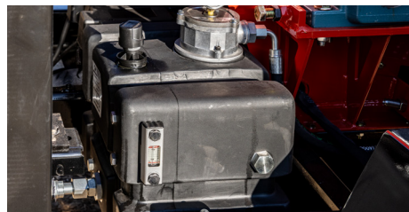
Composite Fuel and Hydraulic Tanks