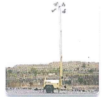
Blue Metal Quarry