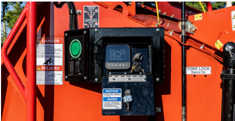
Infeed-Mounted Control Panel